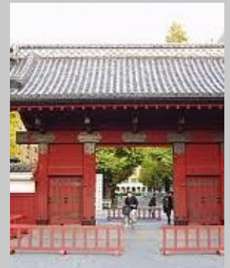
(Akamon, Red Gate)